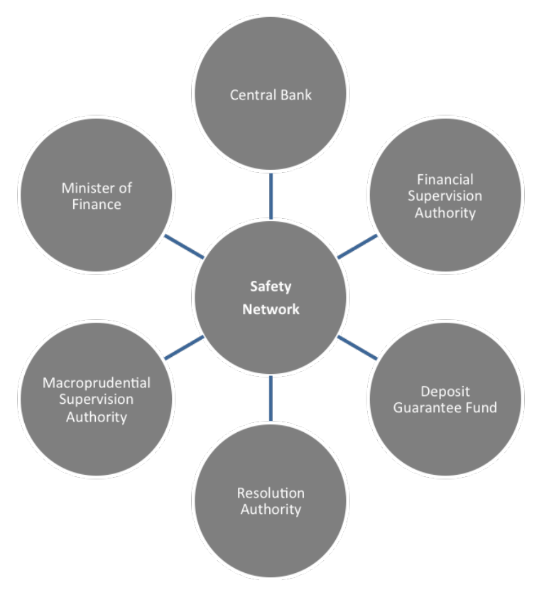
Fig. 4. Structure of institutions in the Security Network

The aims and functionality of the Resolution Authority are pictured in the Fig. 3. This institution would be responsible for carrying out a non-judicial procedure involving the restructuring and liquidation