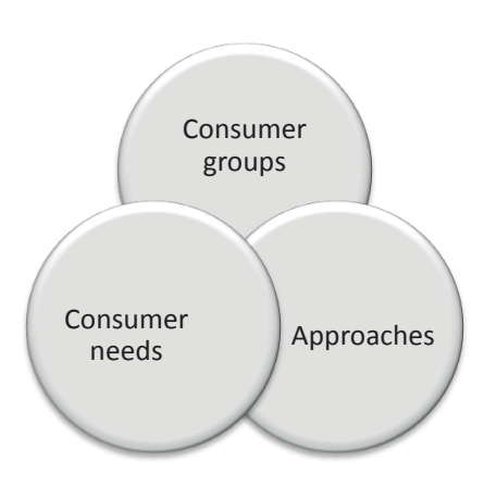
Fig. 2. Chief dimensions for designing a company's mission