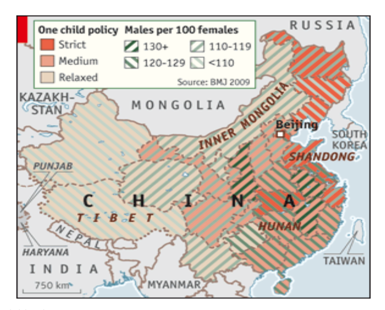
Fig. 1. One-child policy restrictiveness per province